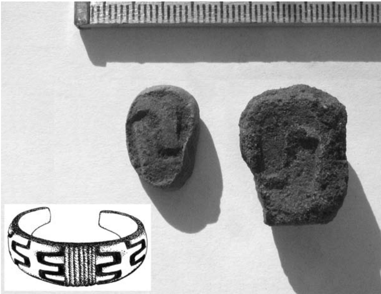
Fig. 1. Modern clay imprint and fragment of a mould for a Gotlandic armring, with a sketch of the ring; Stenberger's type Ab 3 . Photograph and drawing by Anders Söderberg.

held together by litharge. Sometimes small pieces of bone are visible in the matrix.